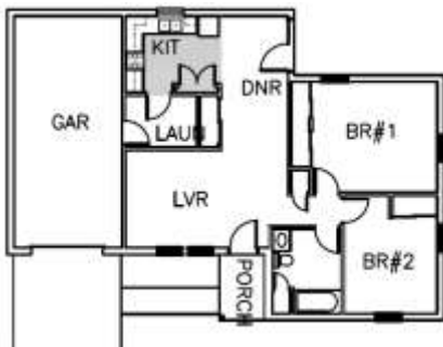
Two-Bedroom Floor Plan